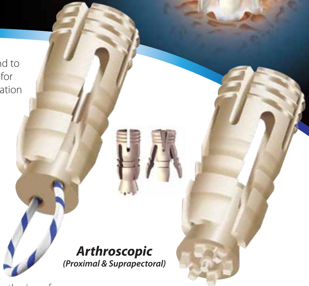
Arthroscopic (Proximal & Suprapectoral)

Cleats facilitate gathering and positioning of tendon